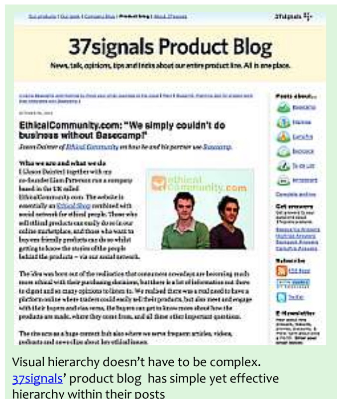
Visual hierarchy doesn't have to be complex. 37signals' product blog has simple yet effective hierarchy within their posts

Make sure, too, that hierarchy within elements makes sense. Your blog post titles, for example, should stand out over any subheadings contained within the posts. Elements within your sidebar should be arranged in a manner that makes sense in terms of usability (for example, the navigation of your blog should appear above any blogroll links you choose to incorporate).